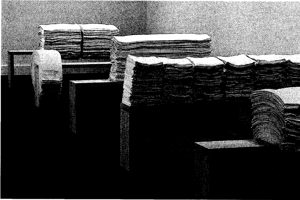
Marcie Miller Gross, Accretion: Divide, Separate, Balance, Fold, Stack , 2001. Used hospital towels and wood, each part approximately 72 x 9.5 x 32 in.

two piles, placed at far ends of the bench, each folded several times lengthwise. Occupying minimal surface area, the stacks seemed to shrink away from one other, exquisitely exemplifying the notion of separation.) With Accretion Gross most fully achieved a powerful balance between formal tightness and potency of meaning. The perfectly aligned edges, soft bulk, and gracefully fanning ends of the bleached linens against the simple geometry of the benches was both visually stunning and viscerally satisfying, evoking a spa's promise of luxurious care. Simultaneously, each of the five components resonated metaphorically, exemplifying a psychological state or interpersonal dynamic, as the materials' bodily associations cast them as human surrogates. This effect was furthered by yellow and red stains, discovered on closer inspection, which established each unit as a unique, intimate document, laden with the residue of past wounds and attempted nurture.